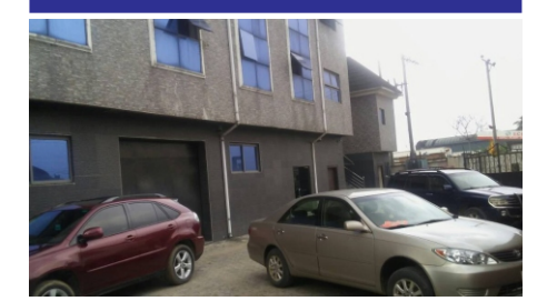
Km 3, Eleme / Akpajo Expressway, Port Harcourt, Rivers State, Nigeria.